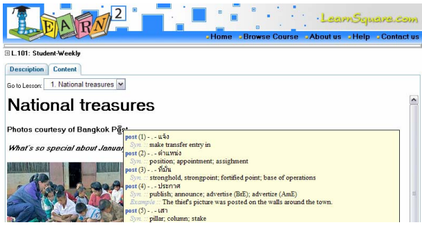
Figure 2 Output screenshot of vocabulary translation.