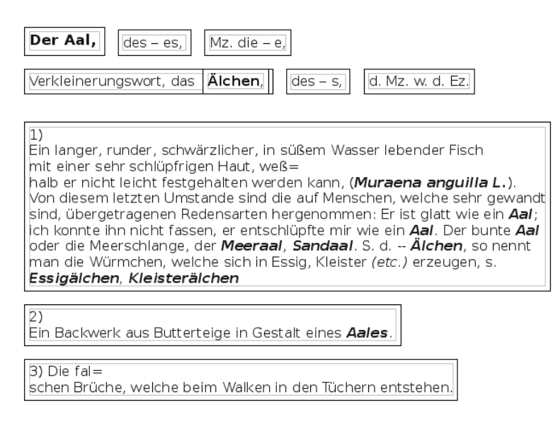
Figure 2: Rendering of an Annotated Entry

this encoding will help us to structure the digital world according to semantic criteria and thus provide an essential basis for constructing reliable ontologies. The annotation of the form block and of the sense block will be described in the Sections 4 and 5, respectively. For both, we have to be able to handle many forms of variation.