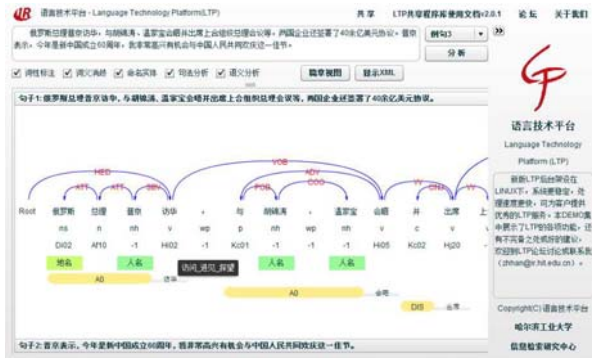
Figure 3: Sentence processing result