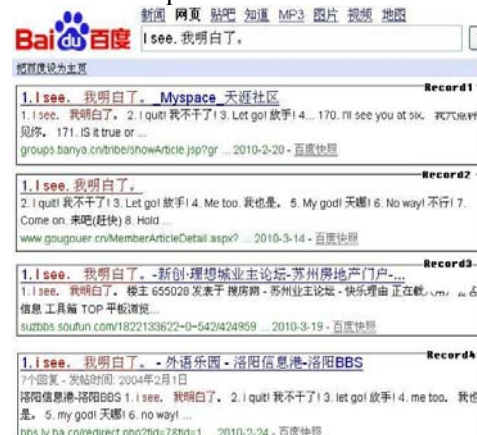
Figure 1. An example of search engine return

Some basic concepts are introduced below.