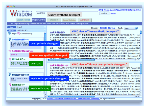
Figure 2: A view of major, contradictory and contrastive statements in WISDOM.

To detect such unidentified contrastive relations, it is necessary to robustly extract contrastive keyword pairs. In the future, we will employ a bootstrapping approach to identify patterns of direct contrastive statements and contrastive key-