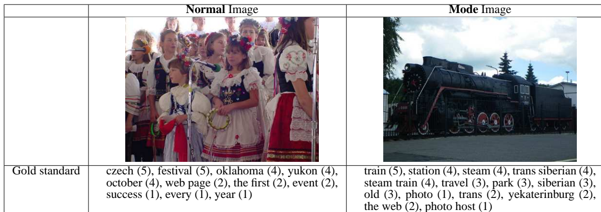
Table 1: Two sample images. The number besides each label indicates the number of human annotators agreeing on that label. Note that the mode image has a tag (i.e. “train”) in the gold standard set most frequently selected by the annotators