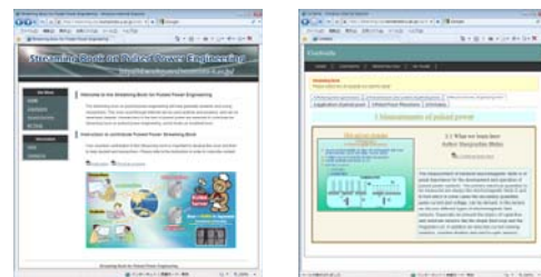
Figure 3. Web pages of Streaming Book

The KUMA system has been applied to a series of streaming video lectures called "Streaming Book on Pulsed Power Engineering," produced by eminent researchers in the field of pulsed power engineering. The figure 3 shows the example of an application of KUMA system The "Streaming Book" is accessible over the Internet and thus can be used anytime and anyplace. The aim of this Website is to deepen understanding of pulsed power engineering by graduate students and young researchers. And this site opened to the world can become a good opportunity which makes a relation with a superior researcher and a student.