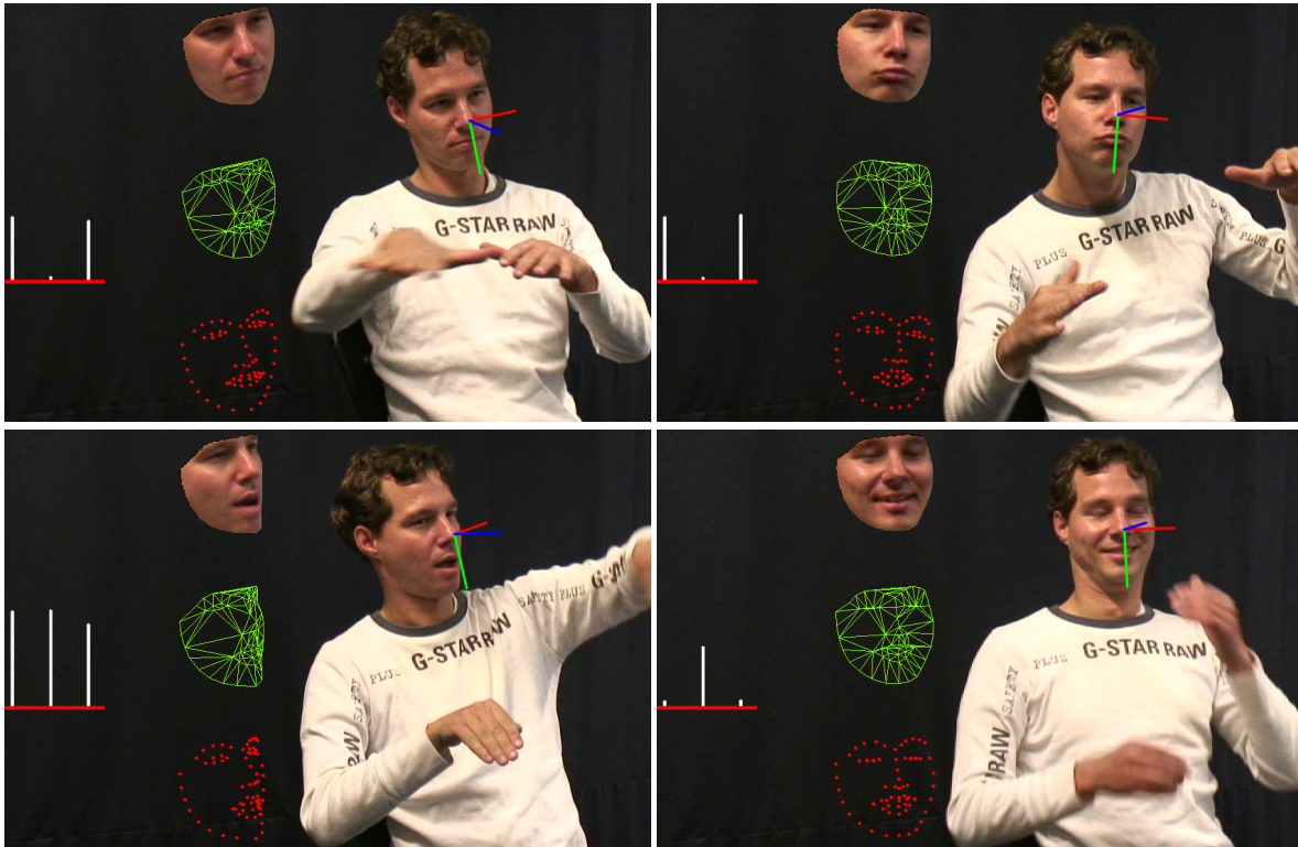
Figure 3: Facial feature extraction on the Corpus-NGT database (f.l.t.r.): three vertical lines quantify features like left eye aperture, mouth aperture, and right eye aperture; the extraction of these features is based on a fitted face model, where the orientation of this model is shown by three axis on the face: red is X, green is Y, blue is Z, origin is the nose tip.