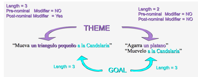
Figure 3: Annotation of two utterances in mono-clausal and bi-clausal realizations.

We perform a binary logistic regression model to predict whether speakers choose a bi-clausal over mono-clausal realization based on the following predictors: theme description length, existence of prenominal modifier, and existence of postnominal modifier.