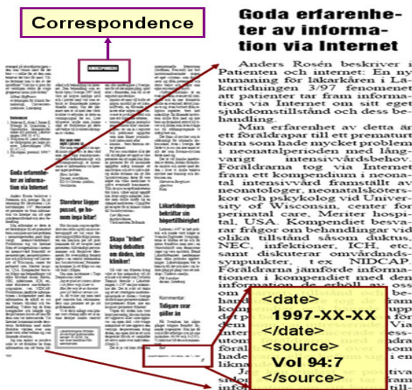
Figure 1: A snapshot of the metadata extraction process.

The archive comes in many format flavors. Earlier issues in pdf -format while the most recent ones in html and .xml . Although the non-pdf editions of the archive were rather unproblematic for the subsequent automatic language processing, the pdf-files posed certain difficulties due to the complexity of the layout of the journal's pages and the different pdf-versions that the material was encoded in. However, all material has been transformed to a unified utf8 text-format. The extraction was made in a semi-automatic fashion with manual verification, since our aim was to preserve as much as possible of the logical text flow and eliminate the risk for losing valuable information such as each article's title, publication details for each issue etc. An example of a typical page under the heading "Korrespondens" Correspondence , is given in (Figure 1).